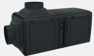
Water-cooled systems available. *Patent Pending

Wine Guardian Pro units come installed with service ports, appropriate pressure switches, and a refrigerant sight glass to allow for faster and more efficient maintenance .